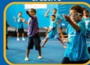
Social & Emotional